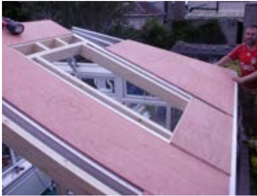
7. Fix timber sheets to rafters using self tapping screws at 200mm centres