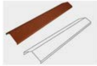
Guardian Ridge Capping