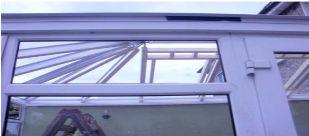
5 Assemble carcass as per layout