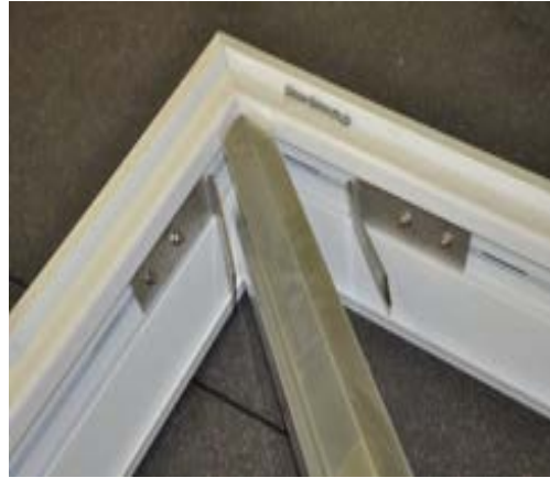
4 Connect rafters to ring beam using cleats and bolts provided