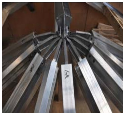
Typical Spider assembly using pins and locking nuts provided