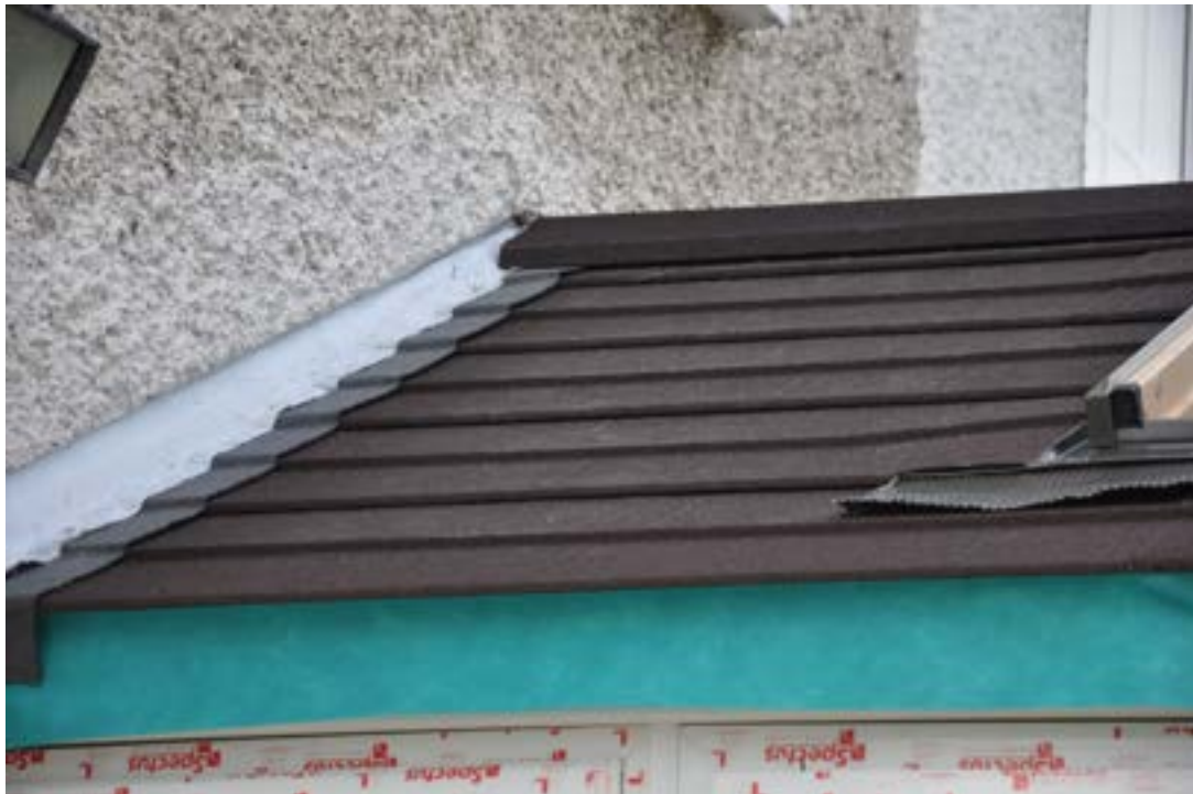
Tiling always to start at the bottom left of the roof. Always start with a full tile with a half tile above.