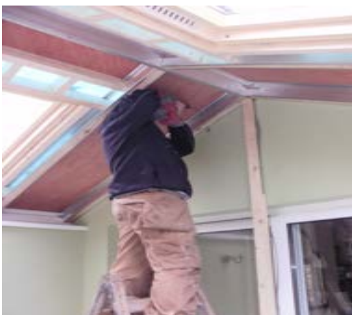
6. Gable rafters to be secured to the house wall using suitable fixings depending on wall