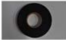
Expanding Foam Tape