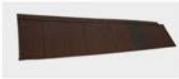
Guardian Roof Tile