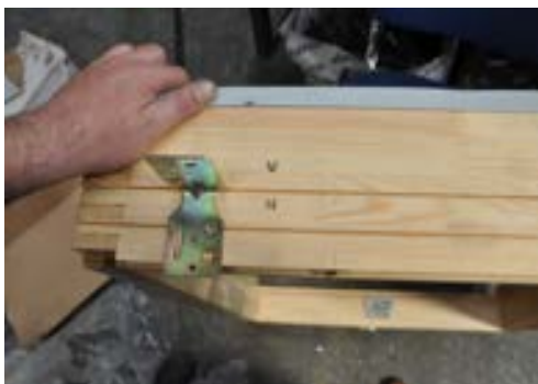
Fakro Window to be fitted to the V Notch