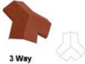
3 Way Capping