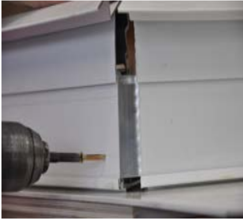
3 Connect ring beams together using cleats and self tapping screws