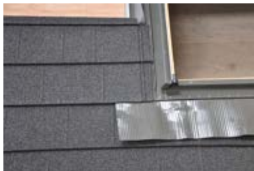
Fakro Tile Flashing installed with Guardian Roof Tile