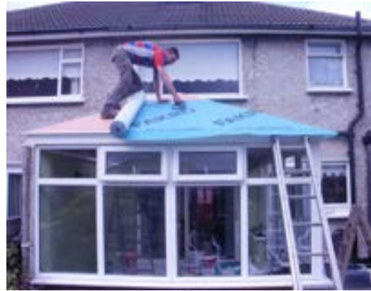
Felt roof using suitable breather membrane. The overhang is 200mm.