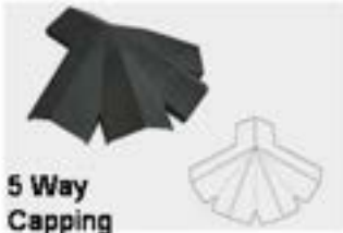
5 Way Capping